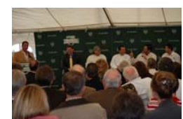
NASCAR celebrities sharing their thoughts and hopes for the project in Smyth County.