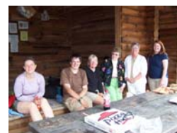
Visitor's center volunteers meet up with Appalachian Trail hikers while on a "fam" tour of the Mount Rogers National Recreation Area Headquarters (MRNRA).

To share the benefits of volunteering with those you love, ask about family or couple's volunteering opportunities. Flexible scheduling will be accommodated as much as possible. Short- and long-term commitments are available. Don't miss a chance to do something good for your community and to have some fun at the same time!