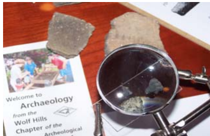
Display of local artifacts at Visitor's Center.

Come in to see the tourism center's newest display, compliments of Dan Kegley, president of the Wolf Hills Chapter of the Archaeological Society of Virginia. See local finds including such as artifacts from the Fox and Bonham sites, including projectile points, ceramic shards and game stones, and bones. You'll even get to see fragments of an actual cob of maize (corn), which has been preserved for at least 400 years due to carbonization from fire!