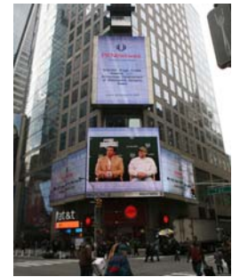
Sheridan Ridge media announcement from Chilhowie, Virginia in the middle of New York's Times Square