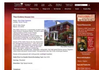
Sample www.Virginia.org listing for the Collins House Inn Bed & Breakfast in Marion.

Travelers won't find you on these sites, if your information is not there. Tell the world you're ready for business!