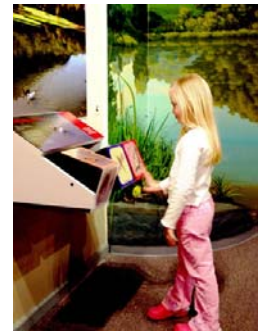
New interactive station at the Museum of the Middle Appalachians.

To learn more about Smyth County on the Wilderness Road visit our web site at www.VisitVirginiaMountains.com and click on the Wilderness Road logo on our homepage. For more information on visiting the Settler's Museum log on to www.settlersmuseum.com . The 28 Appalachian Driving Tours may be found online at www.visitappalachia.org .